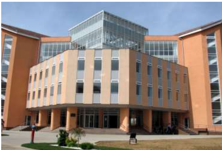
Library of the University of Oradea

staff, a relatively young one, has resulted in the grade received for the activity of research– the first place on the national level in the National Exercise of Research Assessment – NERA, the Excellence Award received from the European Institute of Romania and the Grand Trophy of the Education Section won at the Gala of European Values Multipliers in Northern Transylvania.